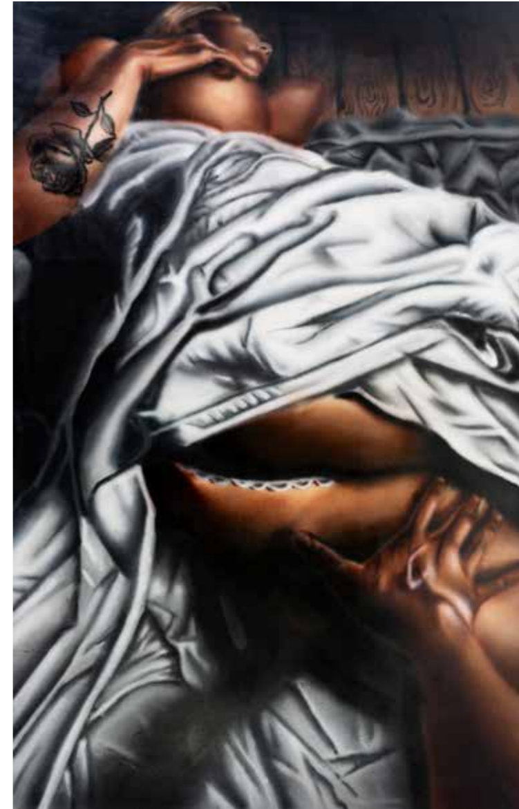
Untitled 9 2018, spray on canvas, 160 x 100 cm. kr 29.500