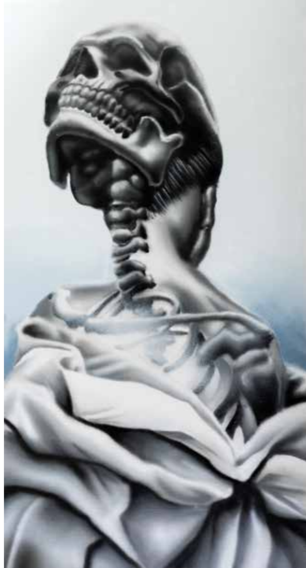
The Devil Is In The Details 2020, spray on canvas, 120 x 65 cm. kr 21.500