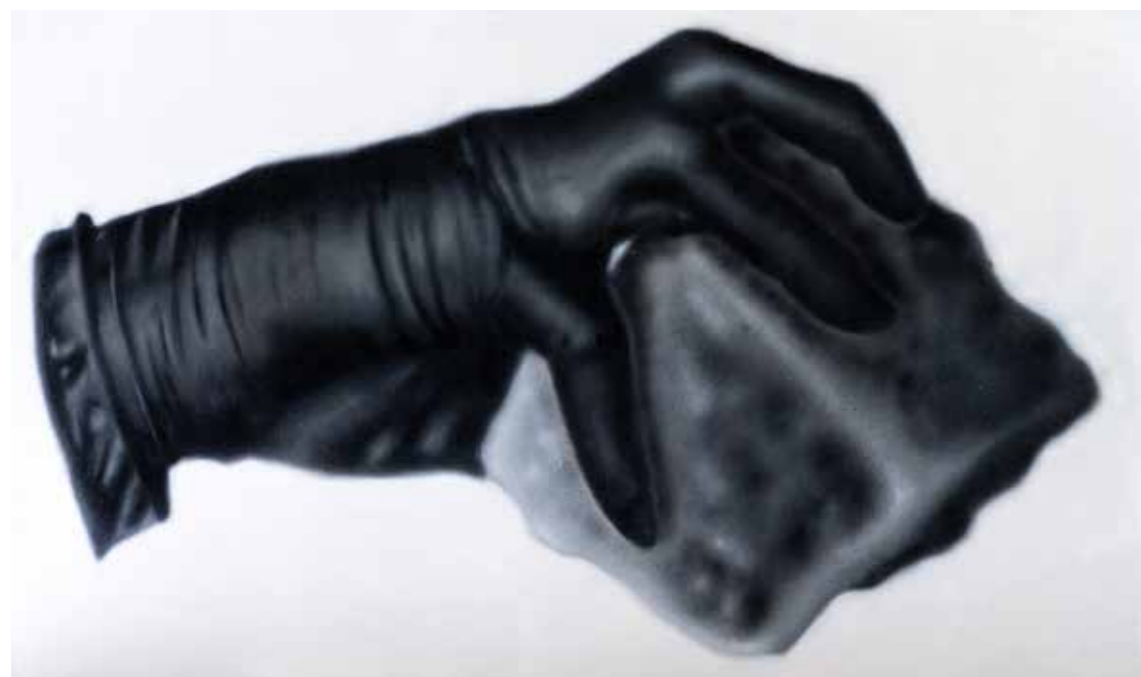
Husker du Benjamin 2020, spray on canvas, 65 x 110 cm. kr 22.000