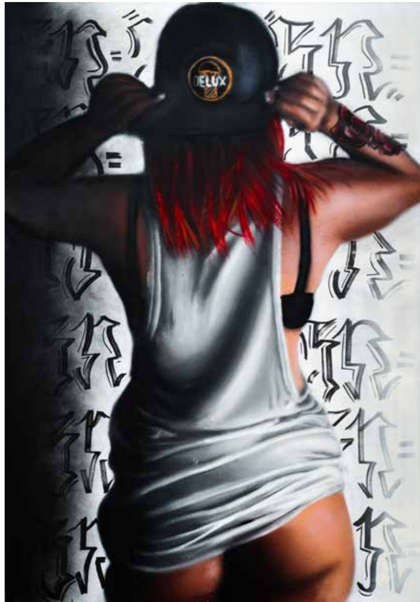
Untitled 16 2014, spray on canvas, 150 x 100 cm. kr 29.500