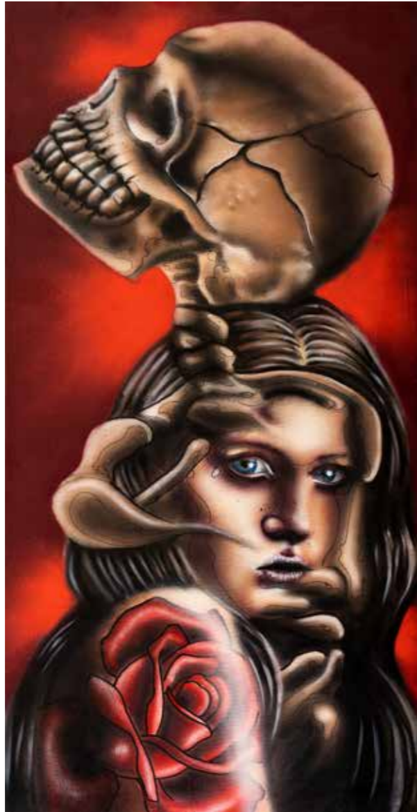
Untitled 10 2021, spray on canvas, 49 x 100 cm. kr. 17.000