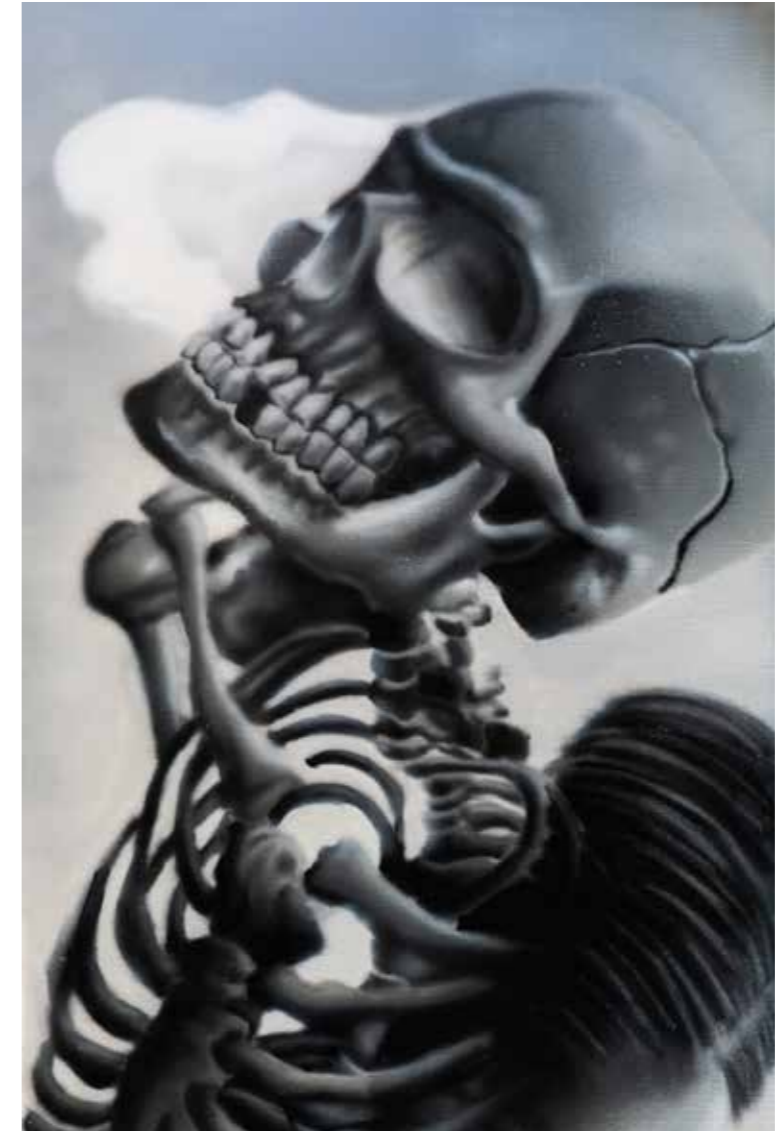
Untitled 3, 2020, spray on canvas, 160 x 65 cm.