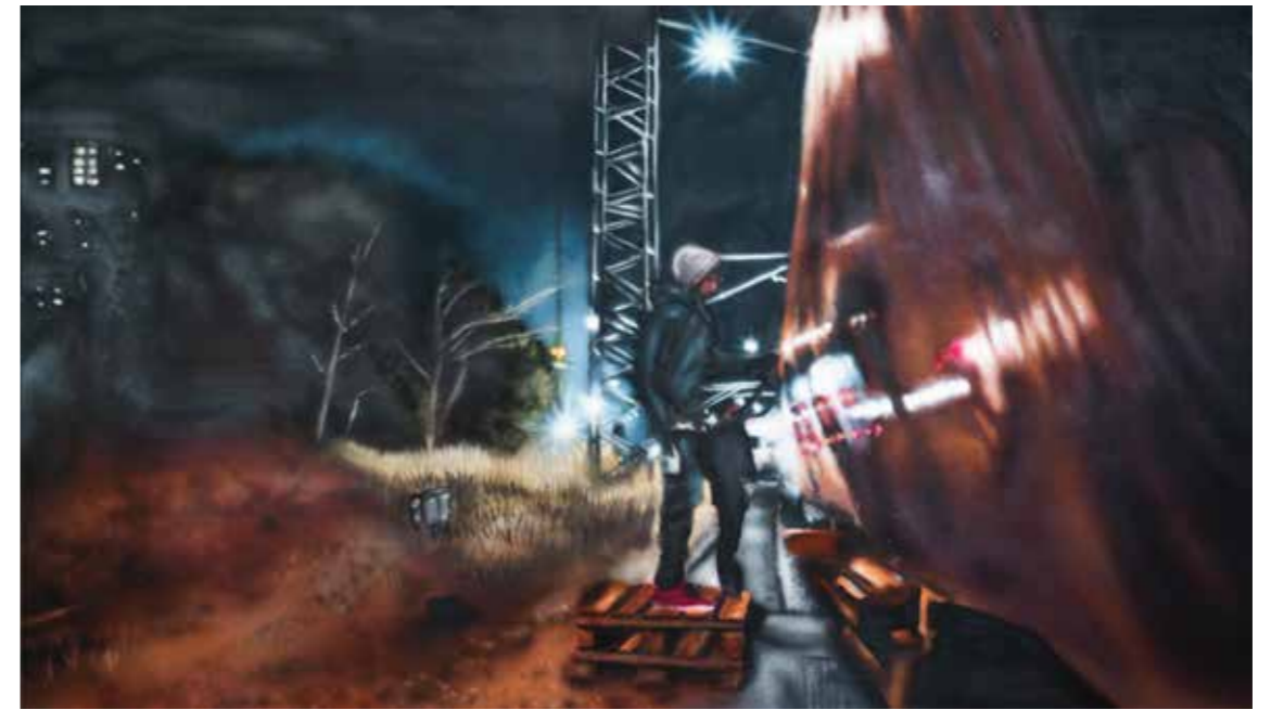
Night Writer 2 2018, spray on canvas, 90 x 110 cm.