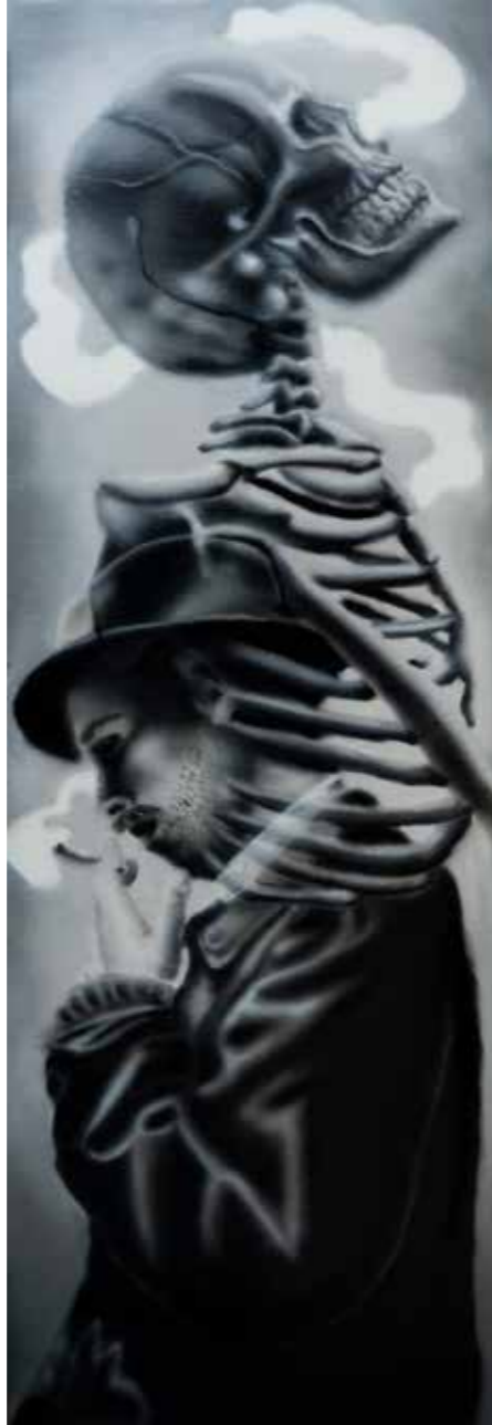
Untitled 4 2020, spray on canvas, 150 x 50 cm.