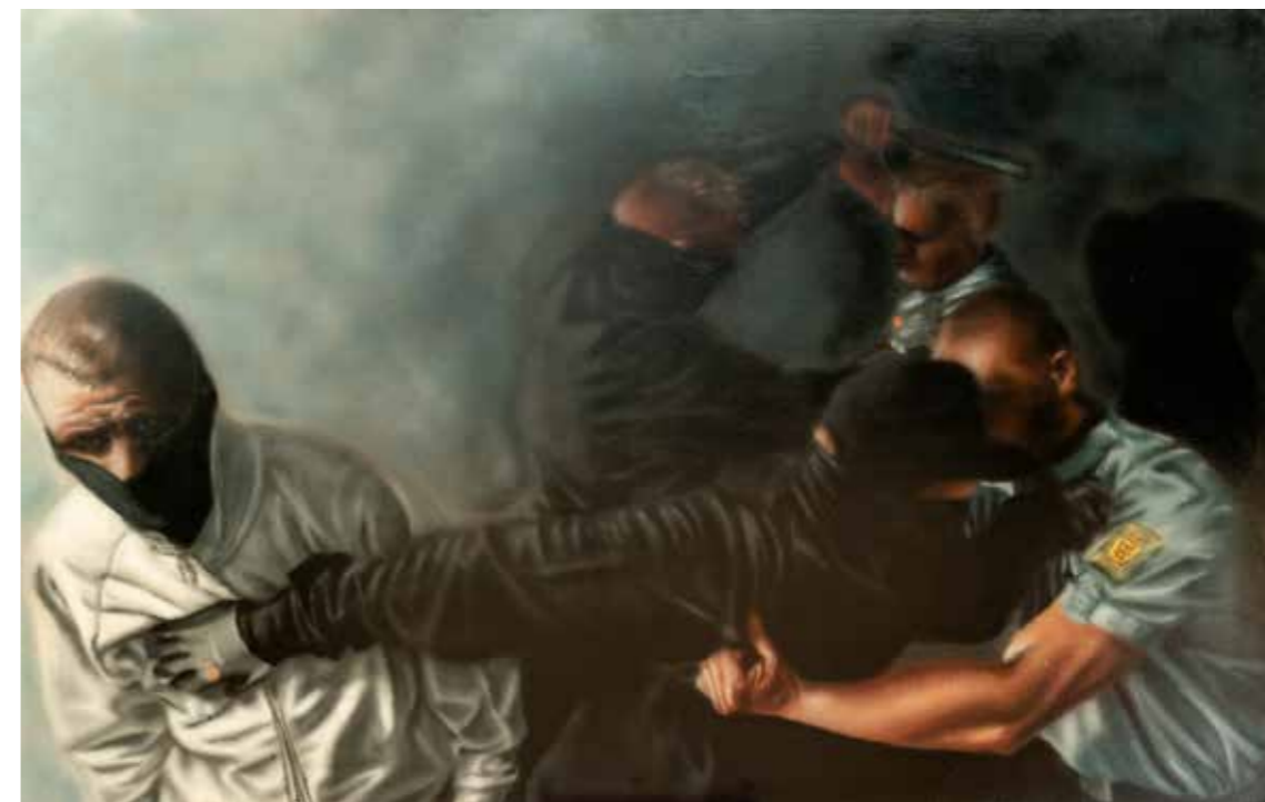
Oprøret kommer 2 2014, spray on canvas, 75 x 100 cm.