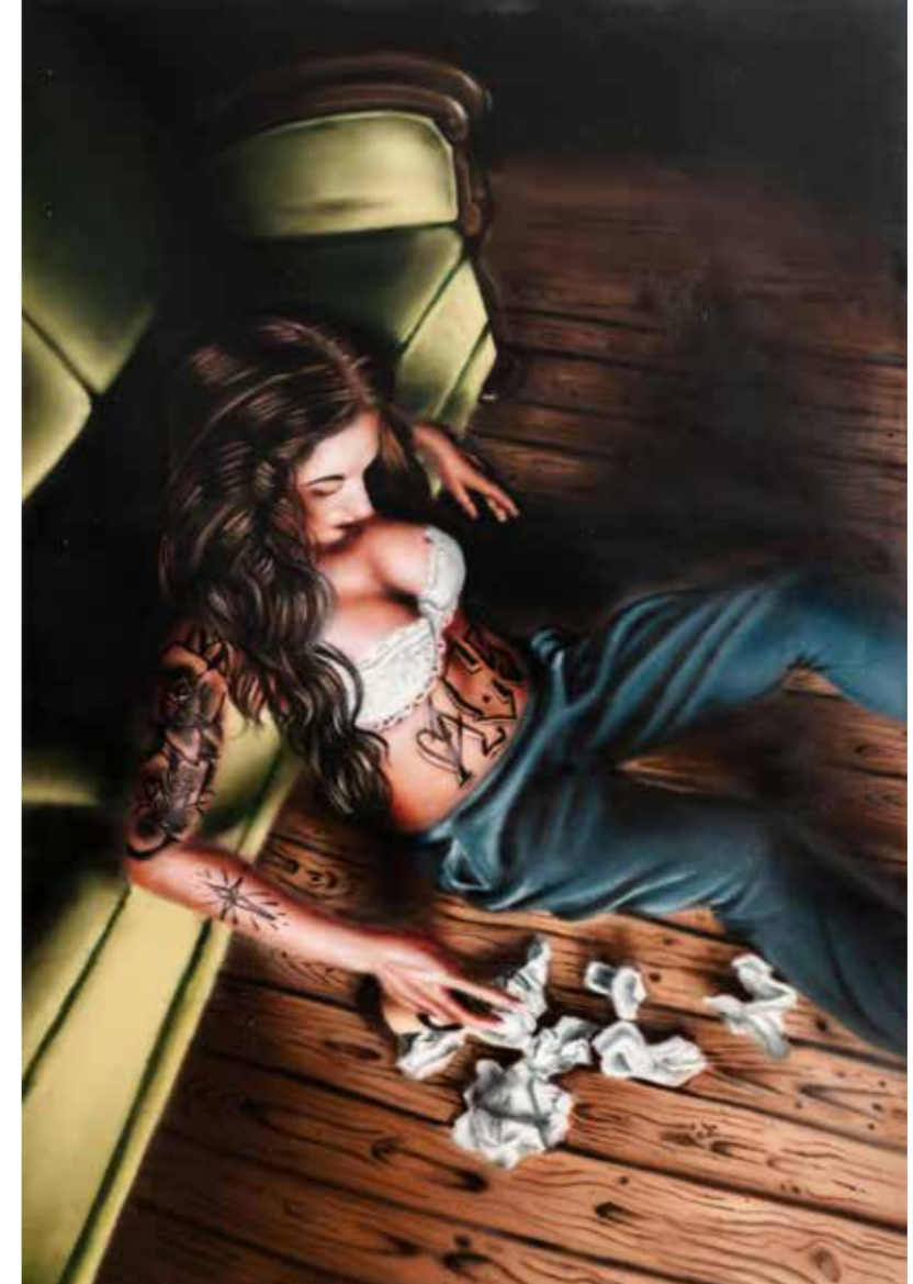
Lost Love 2016, spray on canvas, 180 x 110 cm. kr 33.500