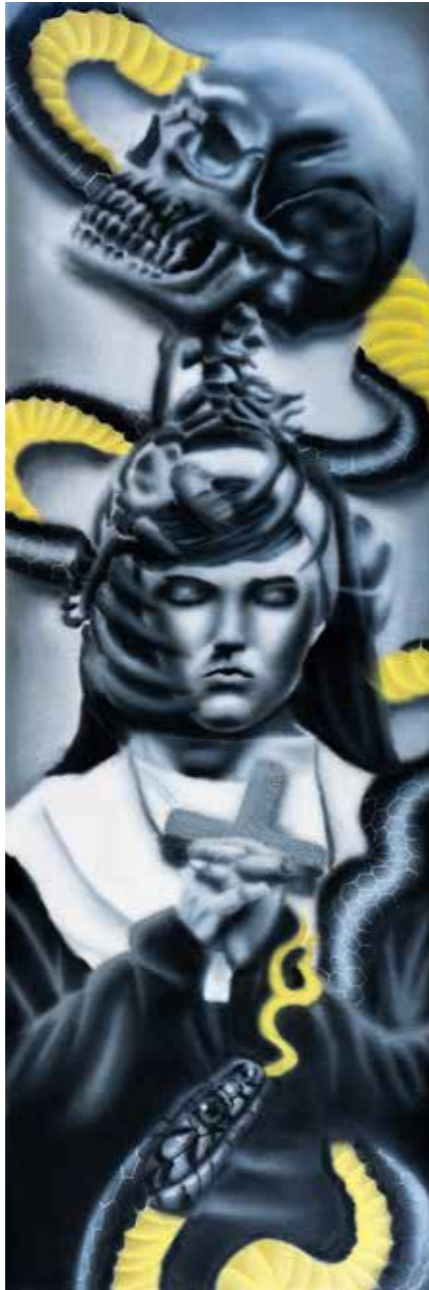
Pray For Us 2020, spray on canvas, 150 x 50 cm.