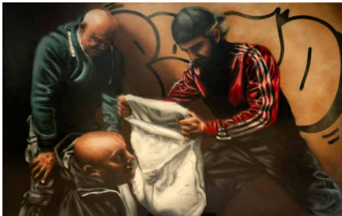
Stikersvin 2014, spray on canvas, 150 x 100 cm.