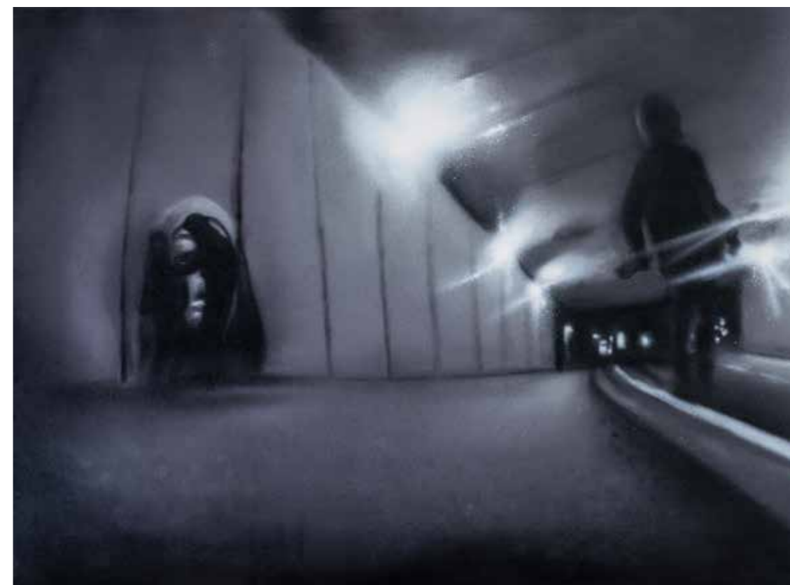
Night Writer 2019, spray on canvas, 110 x 200 cm. kr. 32.000