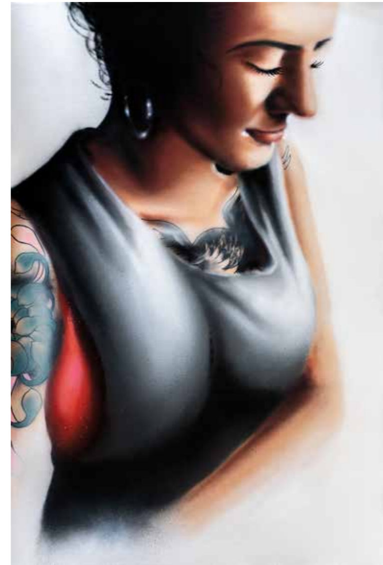
Untitled 5 2018, spray on canvas, 90 x 60 cm.