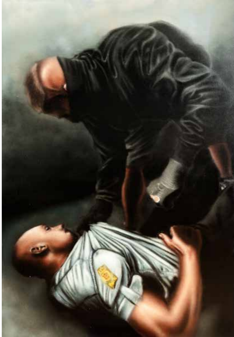
Oprøret kommer 1 2014, spray on canvas, 150 x 110 cm. kr. 35.000