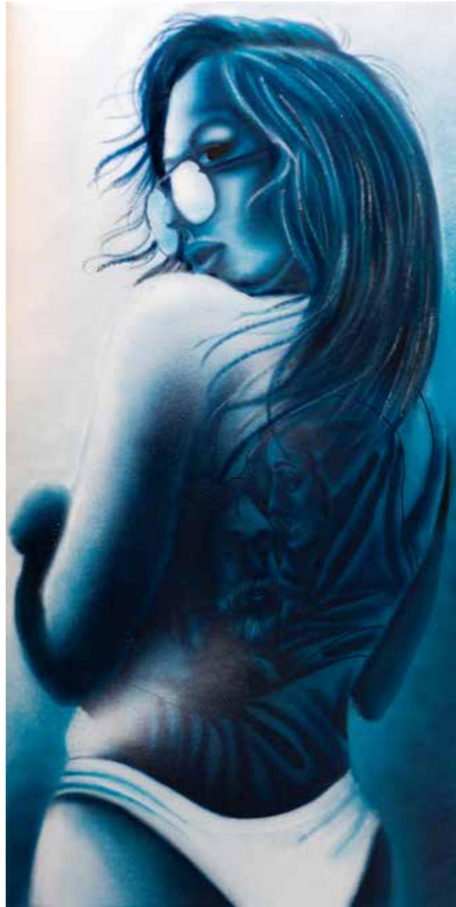
Chola 2021, spray on canvas, 120 x 60 cm.